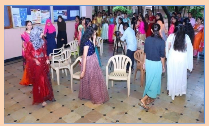
Students participated in musical chairs