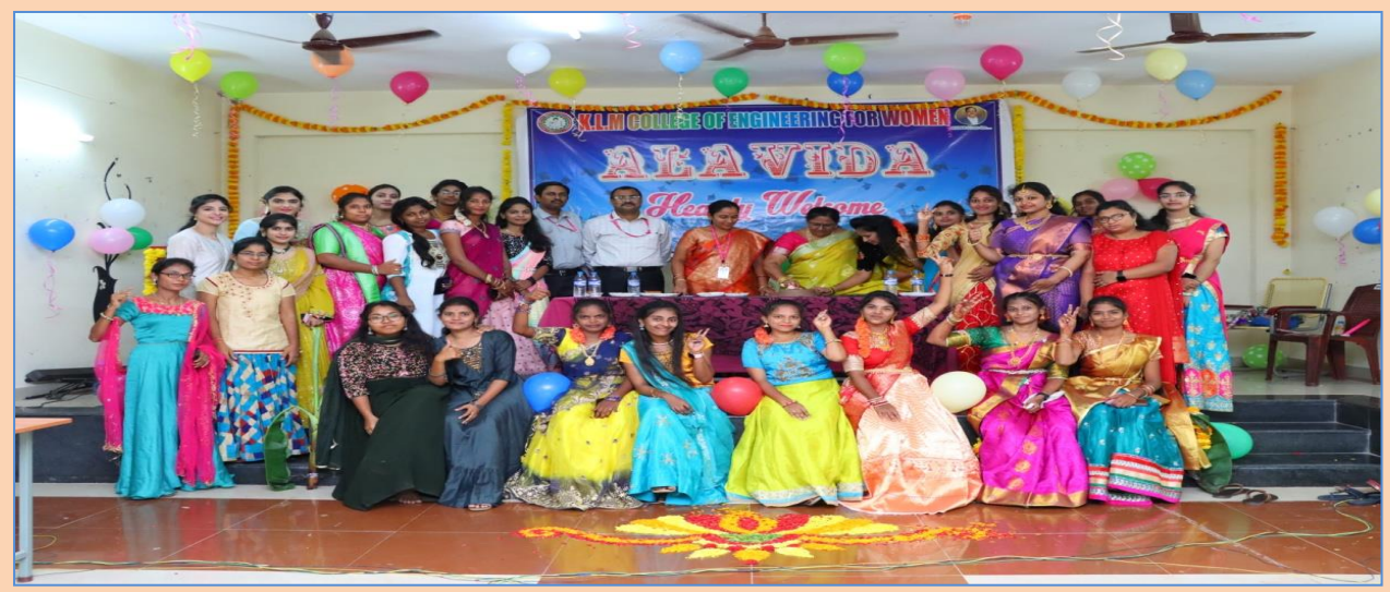
MBA students at ALAVIDA