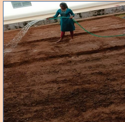
Watering to the farm