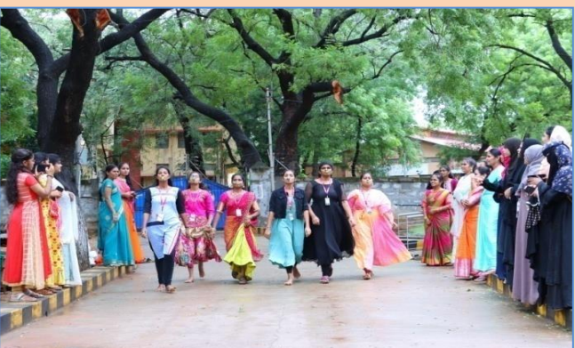
Students participated in lemon and spoon game