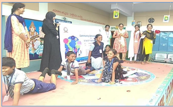
KLMCEW students making the school children doing yoga