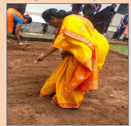
Sowing the seeds Hon. Correspondent