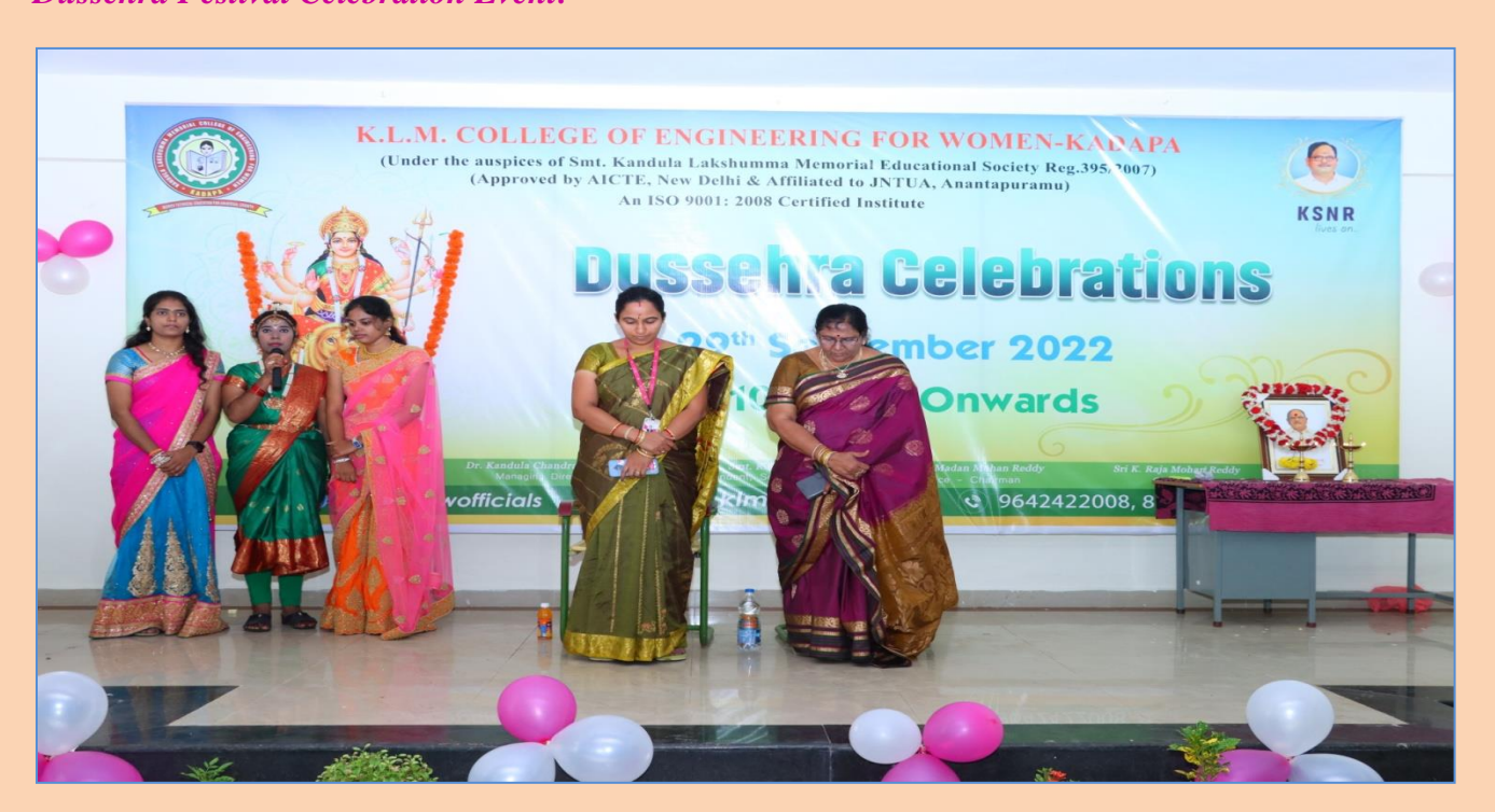
Principal and correspondent participating in (Pre) Dassehra celebrations