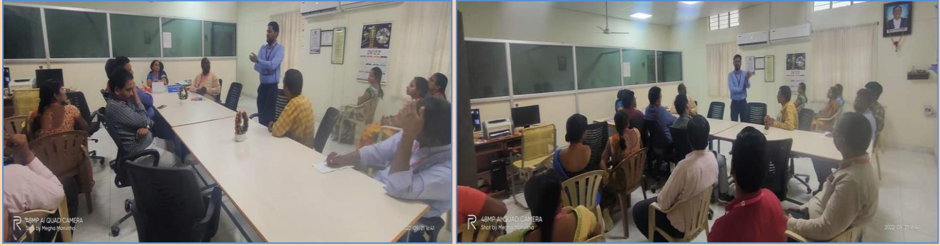
An interaction session with Assistant Manager, Main Post Office, Kadapa

An interaction session with Assistant Manager, Main Post Office, Kadapa about Various insurance policies provided by Indian Posts and it's banking system.