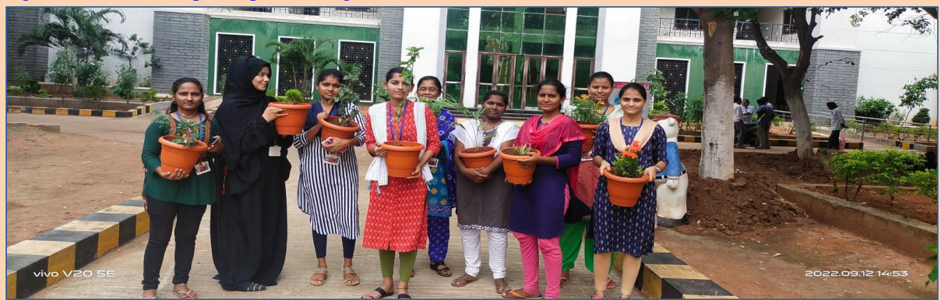
Students donated the saplings in connection with community service project

Plantation (ECE & CSE): Community Service Project for B.Tech second year students which is initiated by JNTUA Ananthapur, plantation (organic farming) held at KLMCEW by the students in this regard. Mentors also participated along with students.