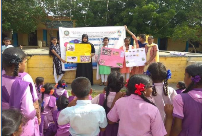
Students creating awareness on traditional healthcare to school children by showing them few charts

Food Habits: Food habits is about what food we eat, how we eat and why we eat it, depending of several factors linked to establish patterns and different manners across cultures. On the other hand, dietary behaviors are generally associated with dietary patterns related to selecting low-fat diets, which are not always related to good eating habits.