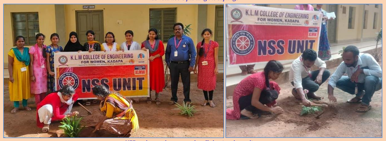
NSS students volunteers and staff planting the saplings