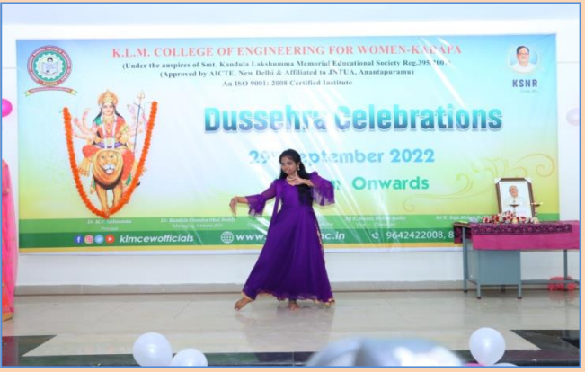
Students dancing for solo performances