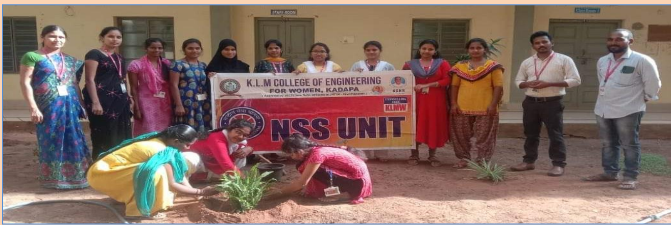
NSS volunteers planting the saplings

On the occasion of NSS Foundation Day 25<sup>th</sup> September, to mark the occasion, we the NSS unit of KLMCEW has organized a sapling plantation, Volunteers took an active part and planted the saplings in CSE block. The volunteers also took part in cleaning the campus as they conducted clean and green in the campus.