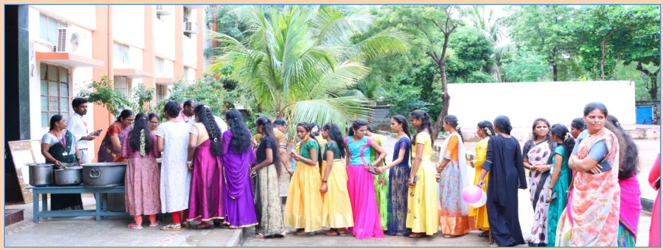
Students relishing the sumptuous lunch