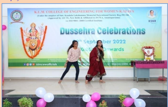
Students performing cultural activities