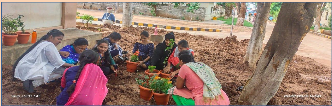
Students planting the saplings