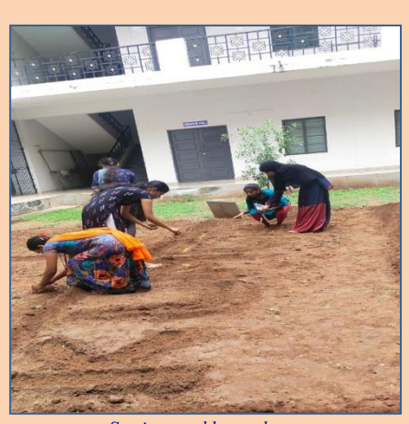
Sowing seed by students