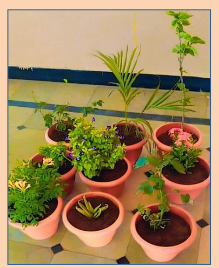
Saplings ready for planation