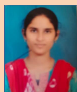
KLMCEW students who took part in Covid-19 booster dose vaccination drive